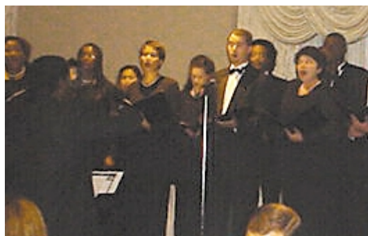
Cal State University Fullerton's Afro-Ethnic Studies Community ensemble entertains EOPS students during dinner at the Annual Recognition Ceremony.