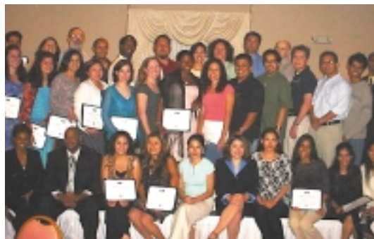
Group photo of 2003 EOPS graduates and/or transfer scholars, at annual EOPS Recognition Ceremony, Embassy Suites, Brea.